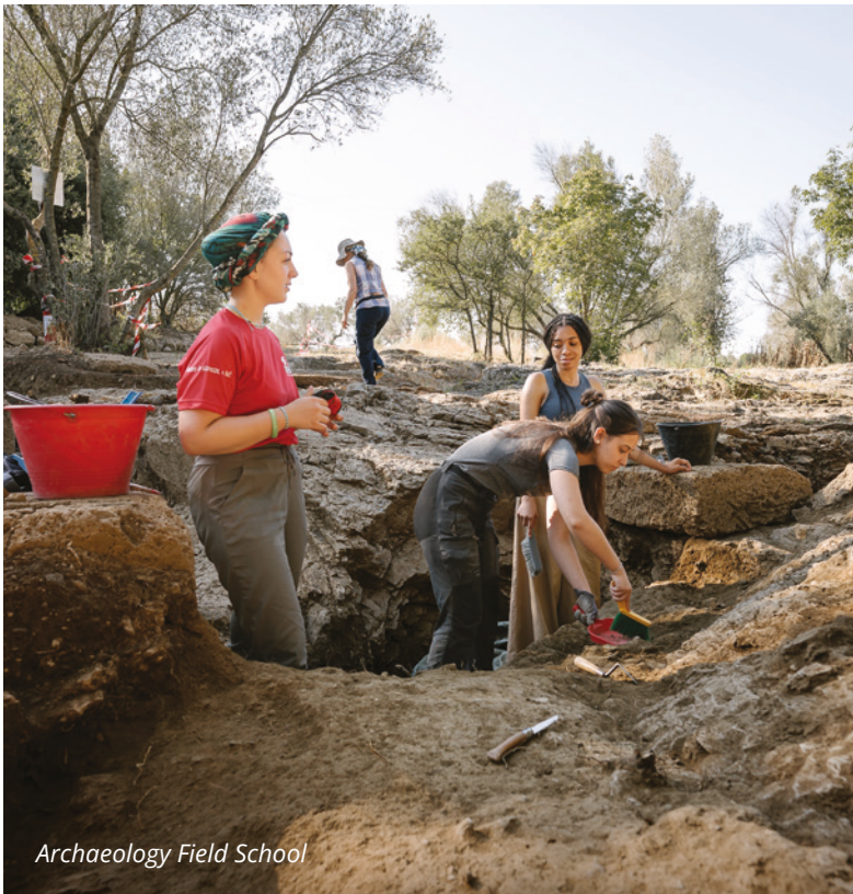
Archaeology Field School