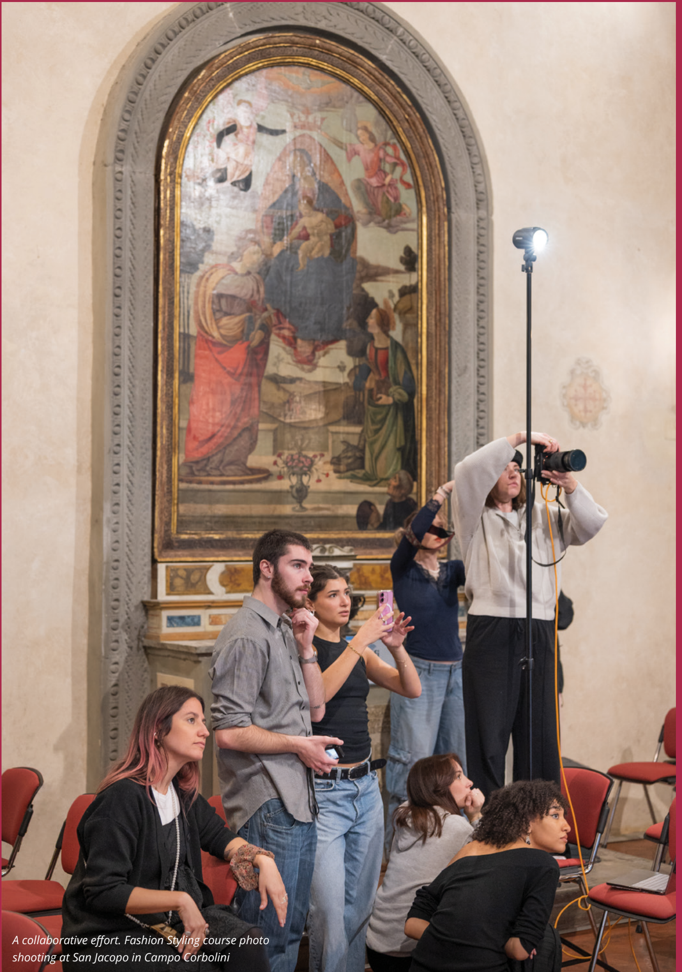
A collaborative effort. Fashion Styling course photo shooting at San Jacopo in Campo Corbolini