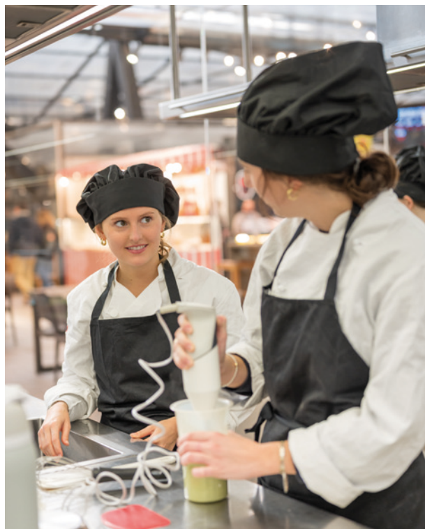
Classes at Mercato Centrale, San Lorenzo

By focusing on the lessons of past and present cultures to cultivate a better tomorrow, LdM challenges students to evolve within the global community and to expand their knowledge and understanding of the world.