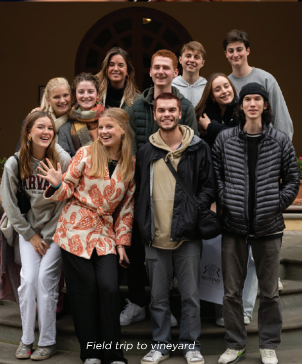
Field trip to vineyard