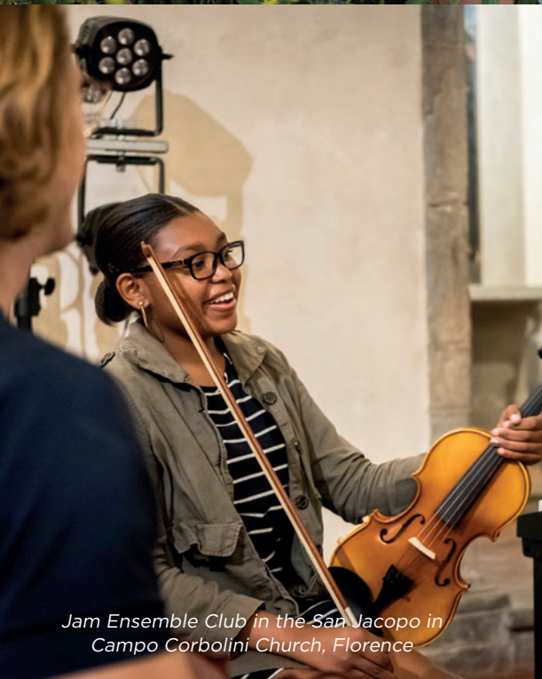
Jam Ensemble Club in the San Jacopo in Campo Corbolini Church, Florence