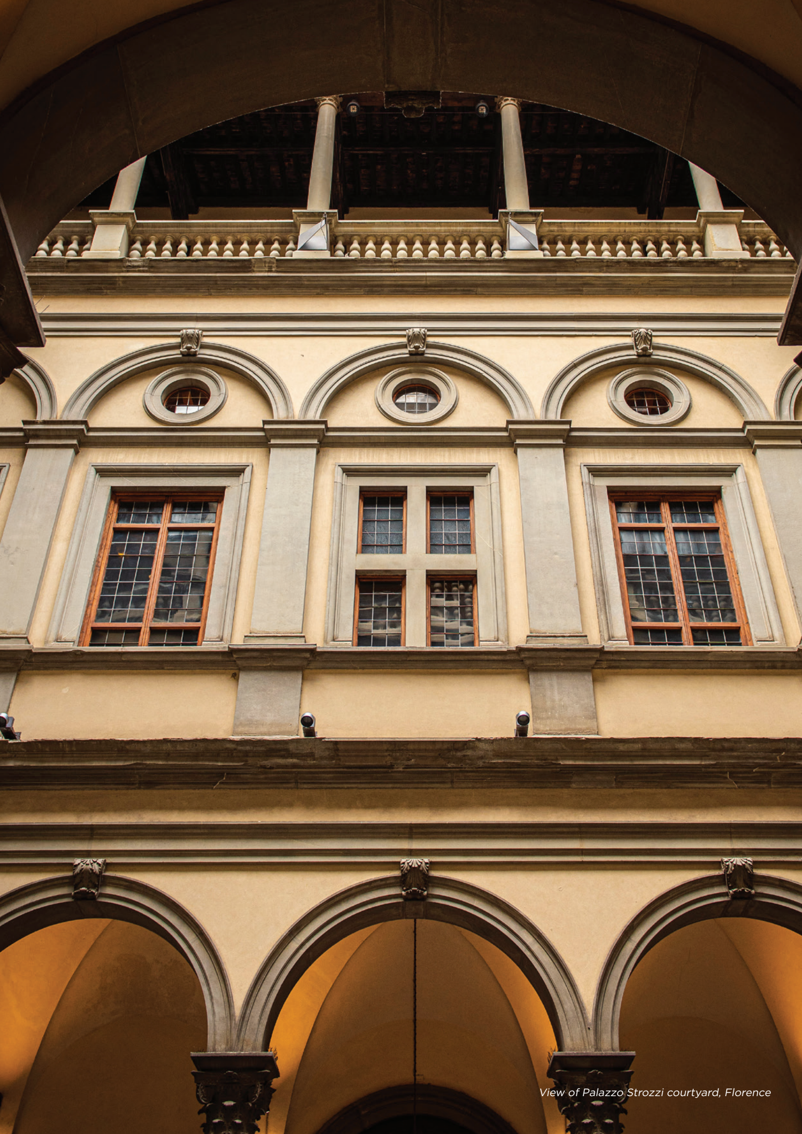
View of Palazzo Strozzi courtyard, Florence