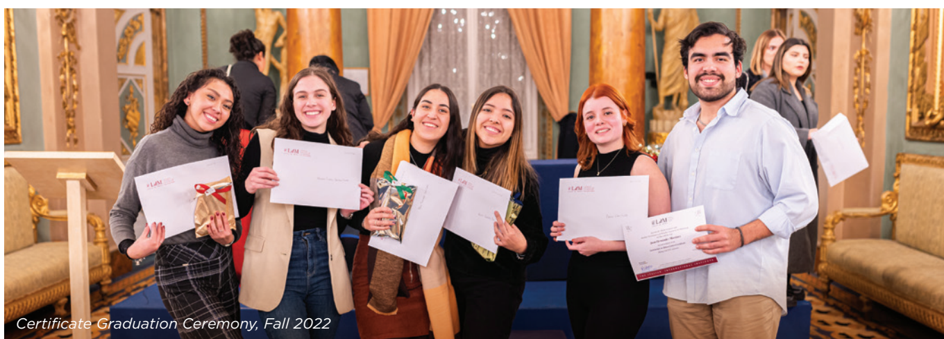
Certificate Graduation Ceremony, Fall 2022