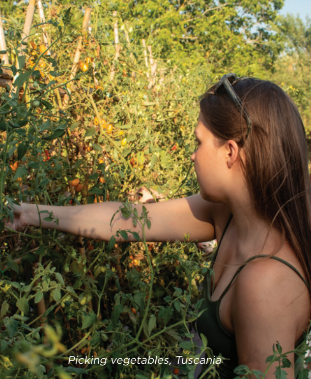
Picking vegetables, Tuscany