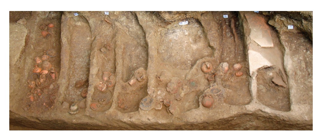
Photo credits: cover, page 7, 8, and 9 (right image) by Simone Stanislai.