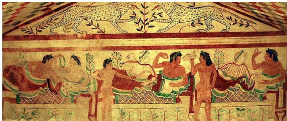
Tomb of the Leopards at Tarquinia, 5th cent. BC