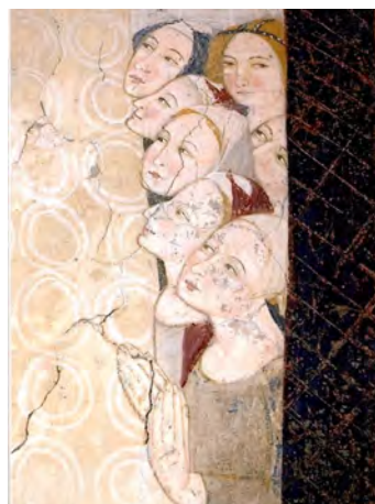
A detail of a fresco inside the Basilica