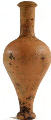
Unguentary for oil and perfumes, 3rd - 2nd cent. BC

See contact address or web site links on the last page.