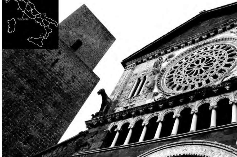
Basilica of San Pietro at Tuscania, 11th century