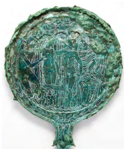
Above: An incised bronze mirror with gods from a tomb near Tuscania, 3rd - 2nd cent. BC Left: Three stone sarcophagi inside a tomb near Tuscania, 3rd - 2nd cent. BC Below: Archaeologist exploring a tunnel in a tomb

Students play an active role in the excavation of the Etruscan necropolises, the cities of the dead, near Tuscania. Through field trips and by examining the abundance of materials found in this region, students learn about the lives of the ancient Etruscans from archaeological evidence and literary sources.